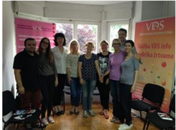
After our 3 hours circle where we learned more about what we like about each other, want for ourselves and the Victimology Society, and how we can achieve those goals