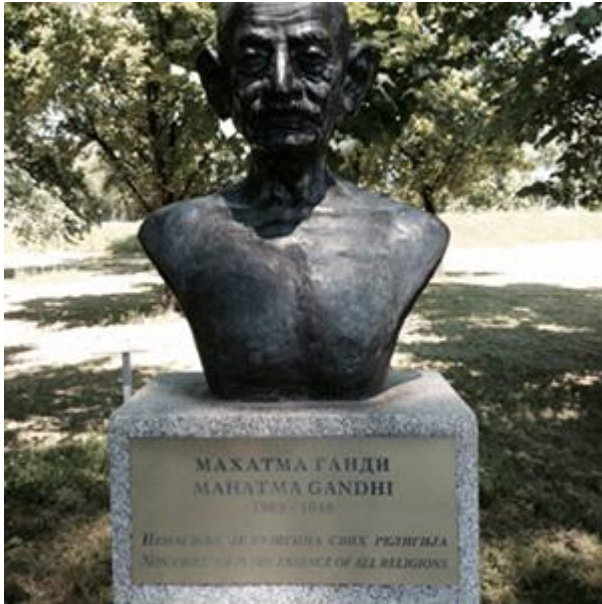
Mahatma Gandhi statute in a New Belgrade park